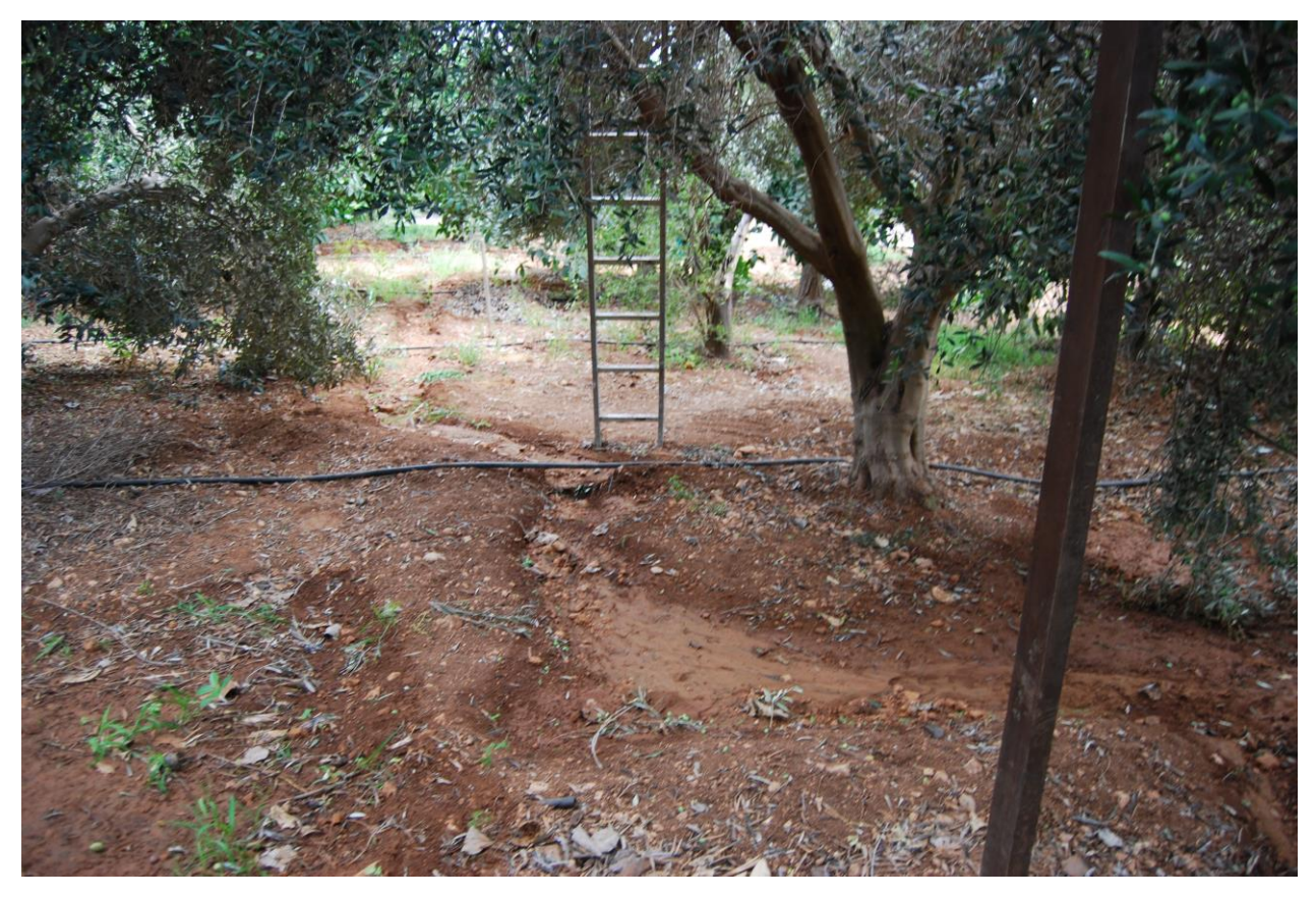
Freshly irrigated orchard.