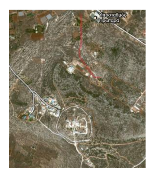
Phanos – Rifle Ranch – Electric transformer

13.10. 2012 6 a.m. The couple arrive at 6.00 a.m. The Game Fund search and find 14 limesticks and an active decoy device outside the garden. Although there are no other trappers anywhere near the couple declare that the trapping equipment does not belong to them and they therefore suffer no consequences.