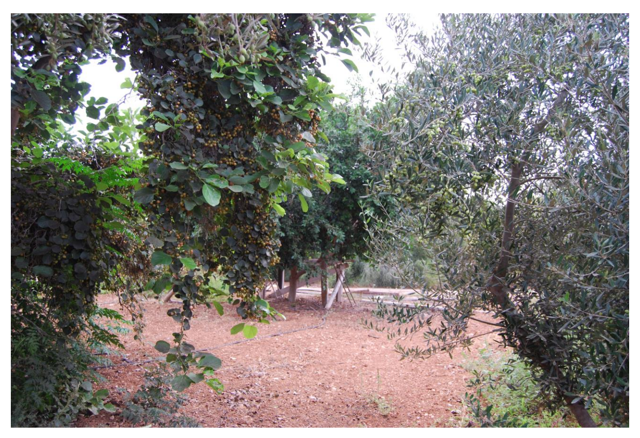
Plum tree growing the plum juice for the glue of limesticks.